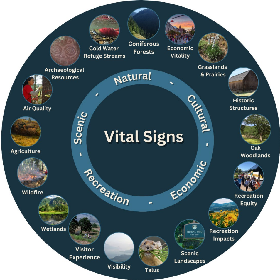
Figure 2. Final List of Vital Signs.

The final 17 Vital Signs are included in the graphic below and a list of all indicators is included in the December 2023 Staff Report .